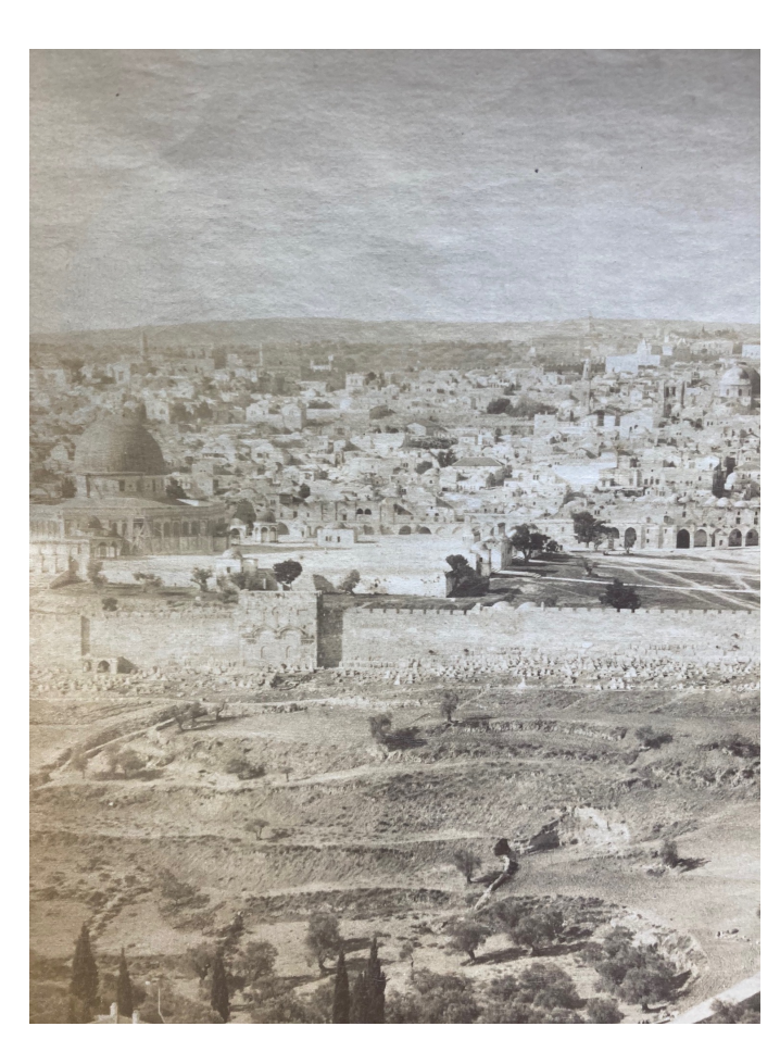
Order No PHO_135